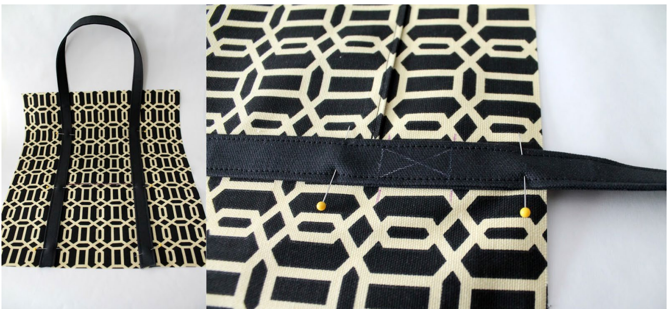
Steps 4 & 5: Attach the Handle and mark the stitch locations.