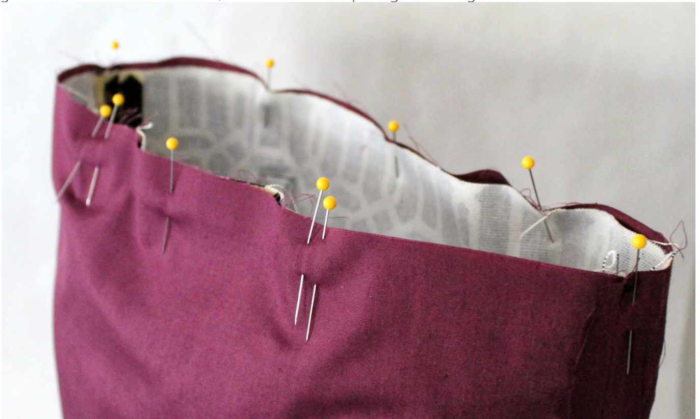
Step 11: Join the Lining and the Outer Shell. | Helpful Tip: When leaving an opening, I use two pins to indicate where I plan to start and stop stitching so that I don't accidentally keep going around.

11. Pin the Handles down onto the Outer Shell so they are out of the way. With the Outer Shell right side out, and the Lining right side in, place the Outer Shell into the Lining so that the right sides are together and the top, raw edges align. Pin in place matching the side seams and avoiding the Handles. Sew together with a 1" seam allowance, but leave a 4–5" opening for turning.