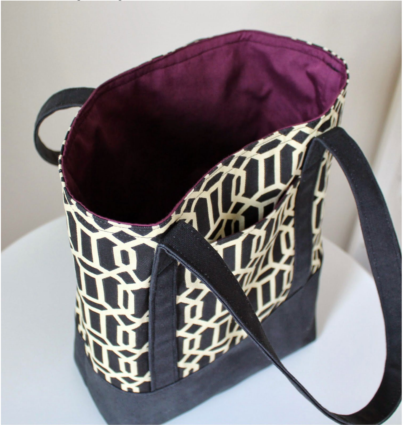
Step 13: Top-stitch the top edge, avoiding the Handles so they fall open easily.